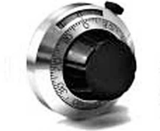
Series RB Precision Concentric 1 13/16" Diameter Analog Turn-Counting Dial